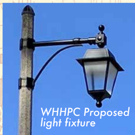
WHHPC Proposed light fixture

The Washington Highlands Historic Preservation Corporation (WHHPC) was organized to preserve the historic and architectural character of the Washington Highlands neighborhood. In 2021 the City of Wauwatosa is installing their default spun aluminum pole and "Cobra" style LED lamp with no historical appeal at the cost of $183.50 per fixture. In contrast, the WHHPC proposed historically appropriate LED fixture price has dropped considerably.